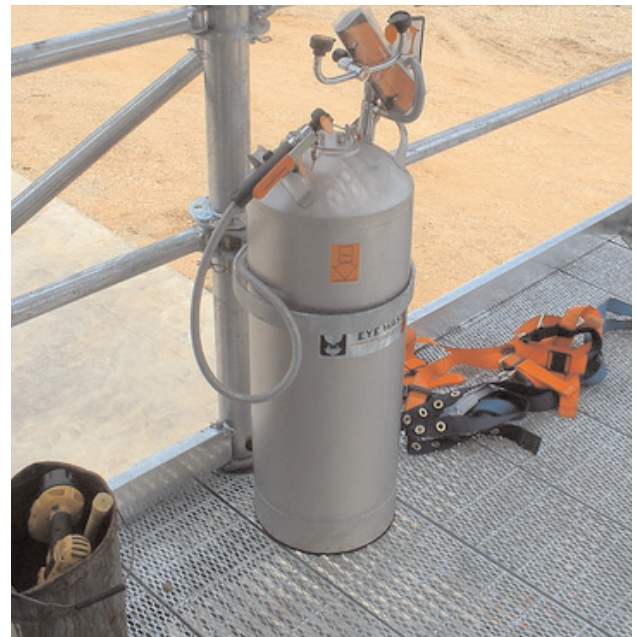
Pressurized Self-Contained Eyewash