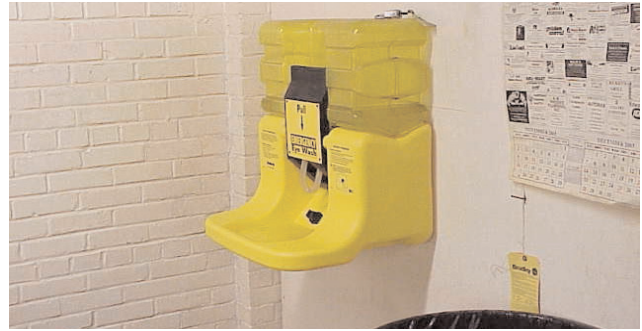
Non-Pressurized Self-Contained Eyewash