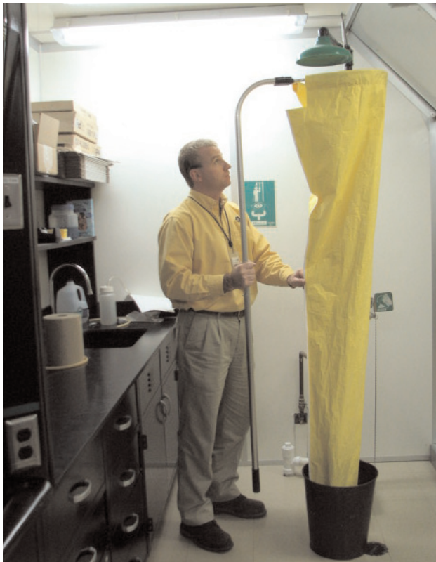
Shower Test Assembly